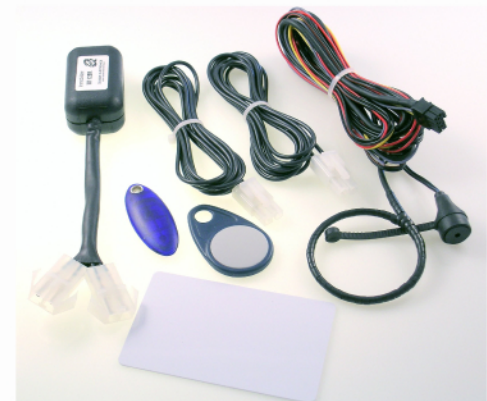
Photo of all system's elements.